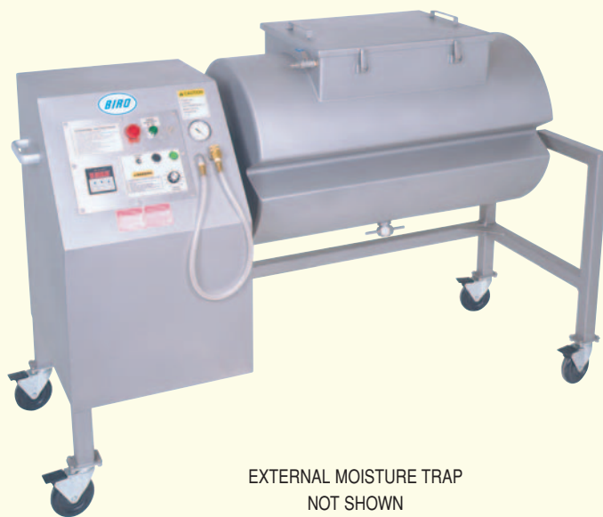
EXTERNAL MOISTURE TRAP NOT SHOWN

Increase your yield and make a better product with the Biro Model VTS-500 Vacuum Tumbler. The three stage timer lets you program relax time into your tumbling cycle for products such as hams or bellies. The heavy duty casters let you do your tumbling virtually anywhere in your plant, and the drain hole in the drum makes cleanup a snap. Run/jog controls let you position the drum for easy cleaning or unloading, and a lug on a cart fits nicely under the drum for easy unloading. Of course, we've made sure that the new Biro Model VTS-500 has a vacuum pump that can evacuate the drum quickly, so you don't have to sit around and wait. All of this means that the Biro Model VTS-500 works harder so you don't have to.